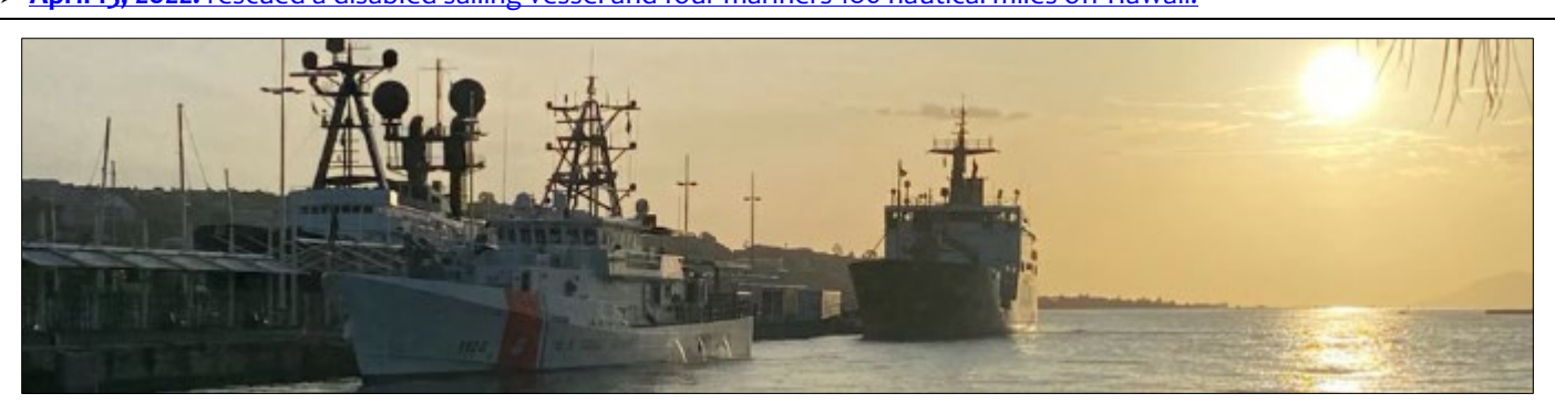
*Note: to access corresponding video/article links, click any verbiage underlined in blue.